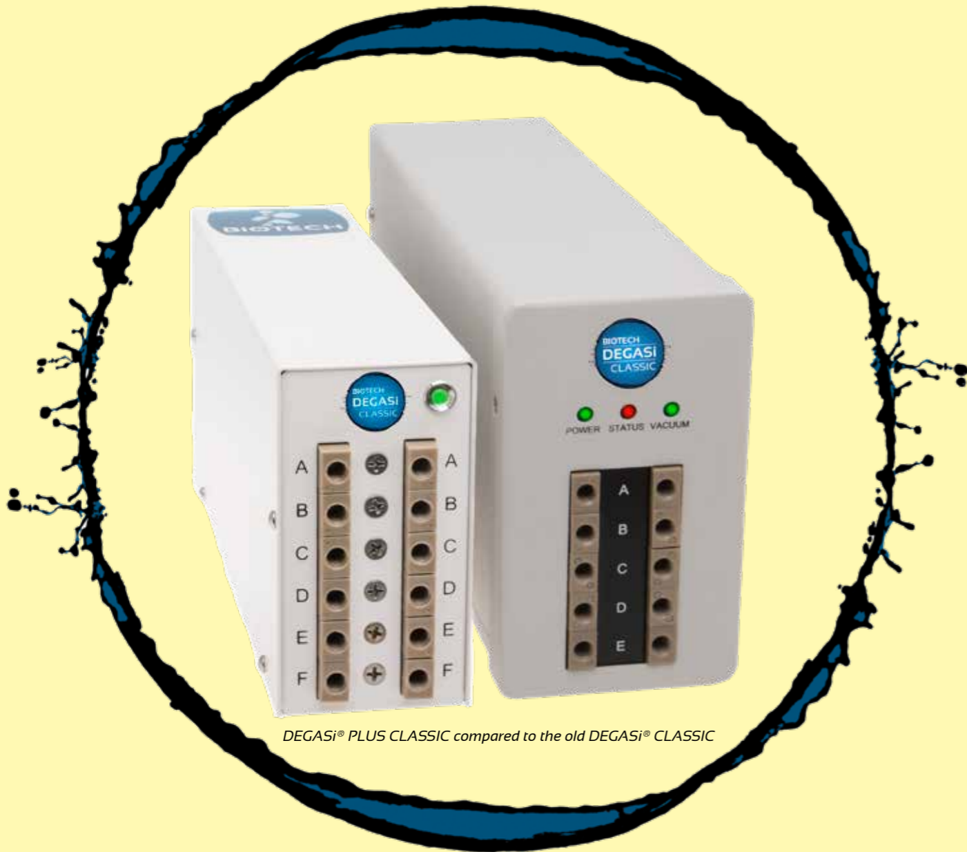
DEGASI® PLUS CLASSIC compared to the old DEGASI® CLASSIC