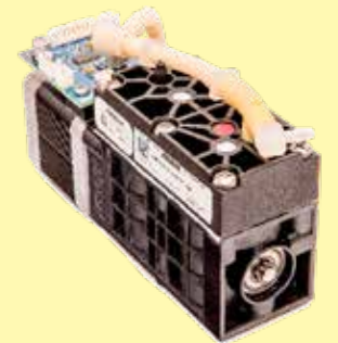
All DEGASI® PLUS Units are delivered with a Systec ZHCR Vacuum Pump with Smart Board