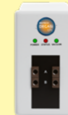
Old DEGASI® CLASSIC